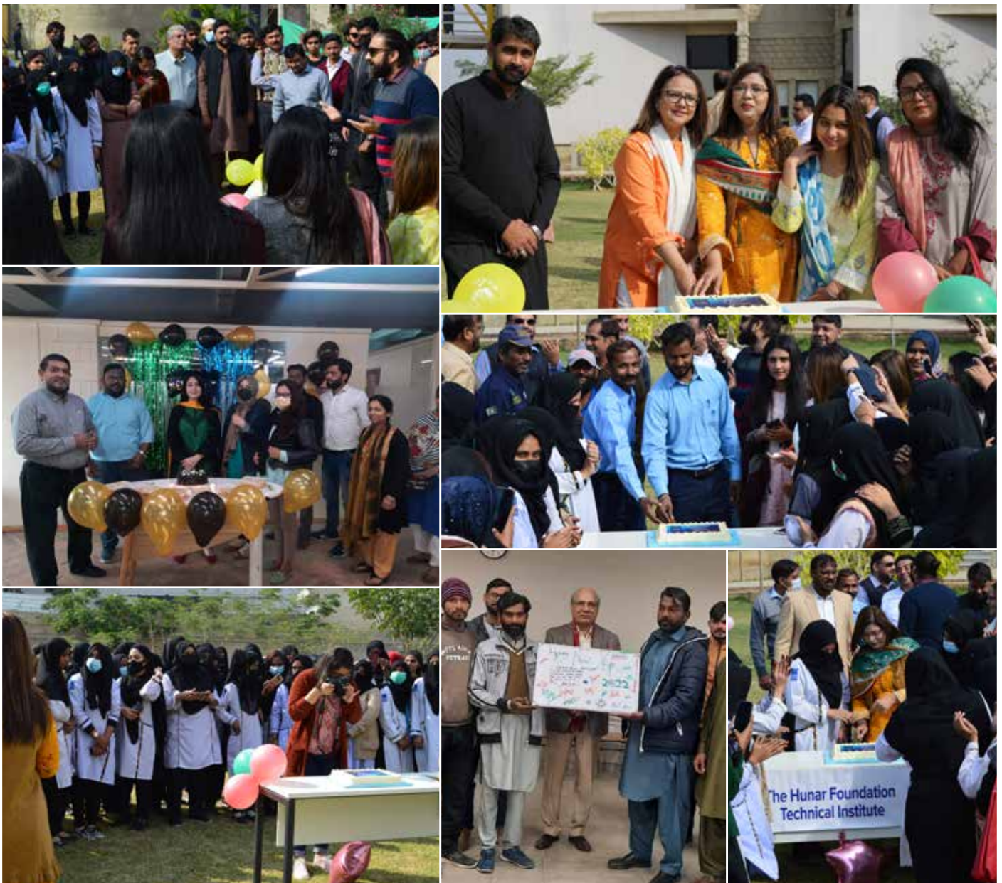
The Students and Teachers of THF Institutes across Pakistan seen welcoming the arrival of New Year 2022

added that the past 2-years of pandemic had made us more determined and has also taught us how to deal with challenges. He further elaborated that every student, every person associated with THF was its ambassador and should continue to help build awareness about THF's mission in the society. He encouraged the students to be consistent in their approach and invite others to learn skills at THF that would help them create a better future for themselves and their families. Similar ceremonies were held at other THF campuses across Pakistan.